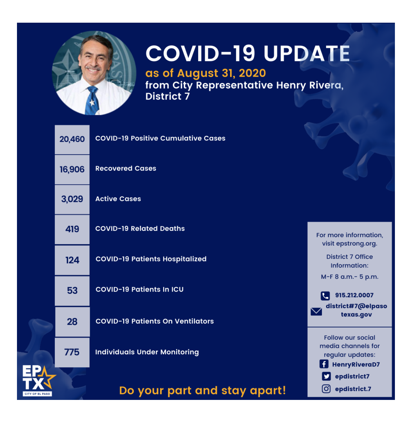
Image: Blue background with below COVID-19 data, virus clip art, photo of Rep. Rivera, and white/yellow EPTX logo.

We are saddened to report one death, 108 new COVID-19 cases, and 2 additional delayed testing results by the State for a cumulative total of 20,460 cases and 419 deaths.