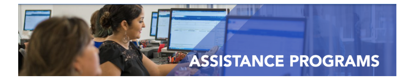
Image: EPE Assistance Program banner found at <a href="https://www.epelectric.com/residential/customer-service/assistance-programs">https://www.epelectric.com/residential/customer-service/assistance-programs</a>

At El Paso Electric, they understand that sometimes you need help paying your bill, so they offer payment arrangements that can offer financial assistance.