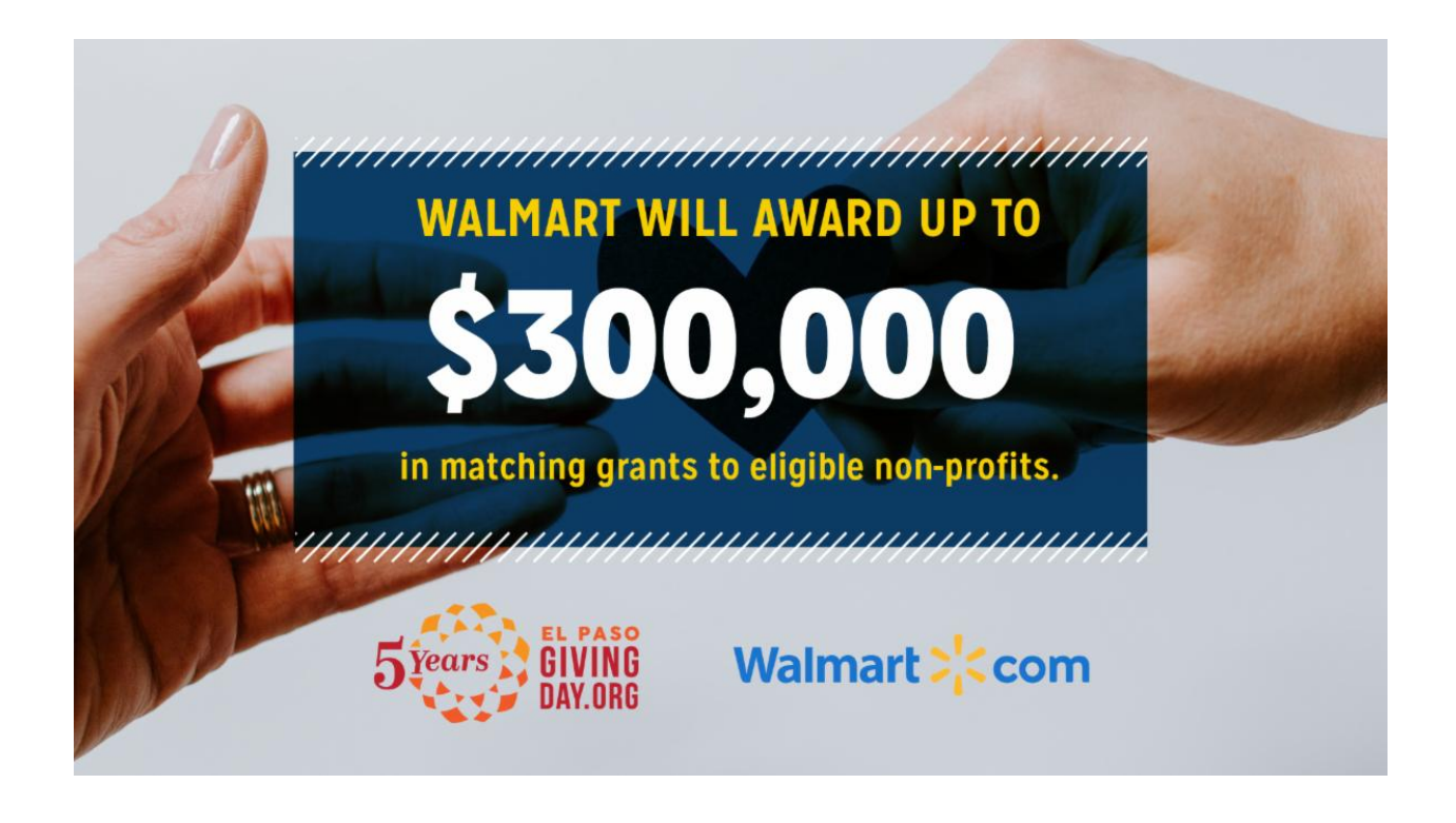
Image: Hands in background with blue square and above title in white and yellow font.

The Paso del Norte Community Foundation today announced Walmart will award up to $300,000 in matching grants to eligible El Paso non-profit organizations through the El Paso Giving Day initiative.